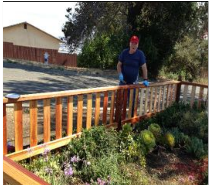
Tom Lee applying the fence protection!