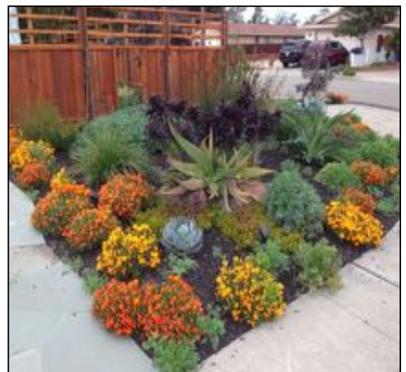
Drought Tolerant Landscape