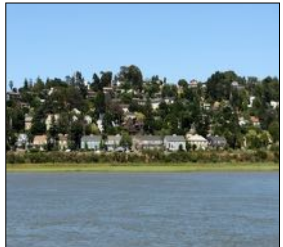
VALLEJO HEIGHTS FROM THE NAPA RIVER