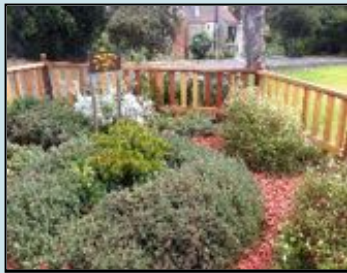
VHNA Garden at Sheveland Park in Vallejo Heights